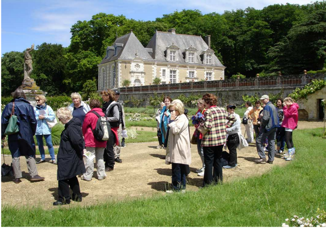
CHATEAU de VALMER

I am very happy to insert photo's from members