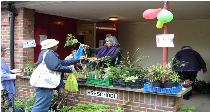
The plant sale sold well as usual