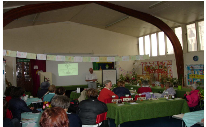
The majority of us were sitting at the back